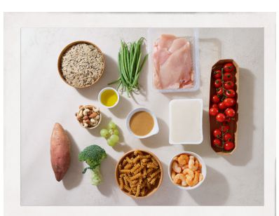
£30 could fund ingredients for food technology lessons for one week