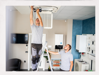
£30 could help us maintain our contact rooms with needed repairs and new toys