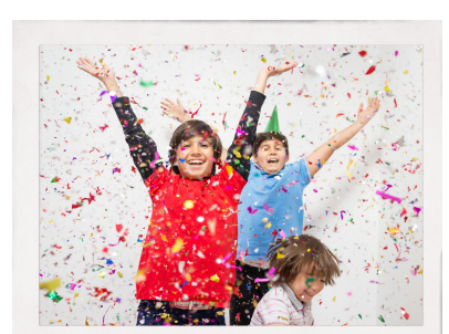
£250 could fund a memorable party or day trip for a group of service users

All donations received by YCC go into a central fund to help with the charity's overall costs. There is also the opportunity for donations to be reserved specifically for certain provisions. Please email fundraising@yccuk.org.uk for more information.